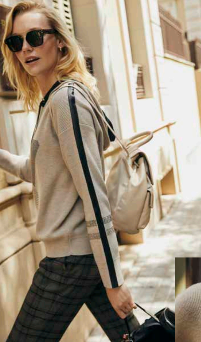
Jumper with hood 68705 Trousers 46016