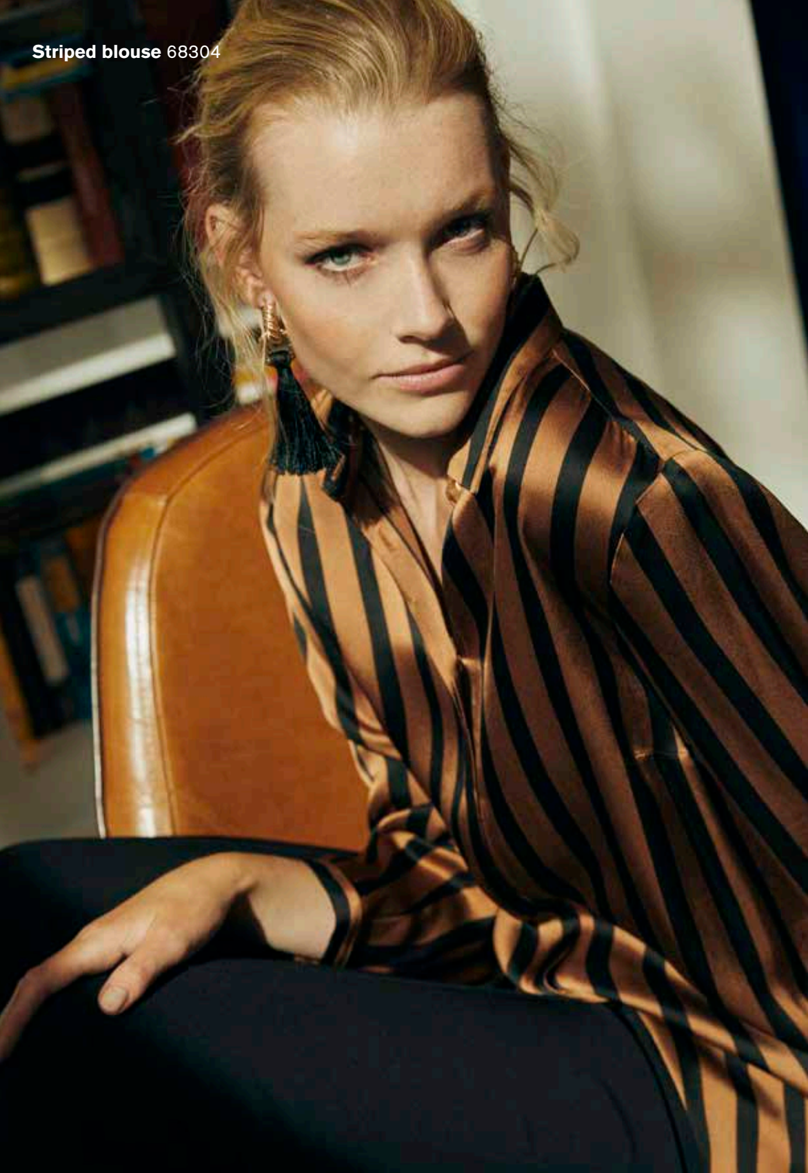
Striped blouse 68304