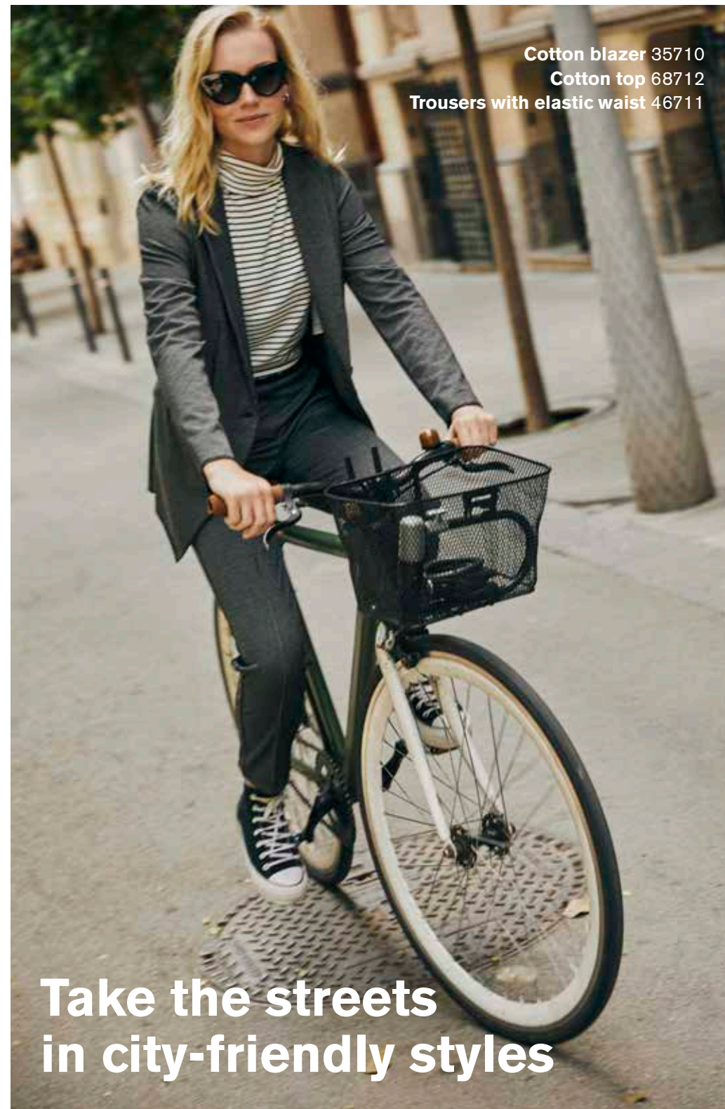
Cotton blazer 35710 Cotton top 68712 Trousers with elastic waist 46711

Take the streets in city-friendly styles