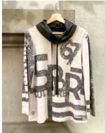
Jumper with leather 68706