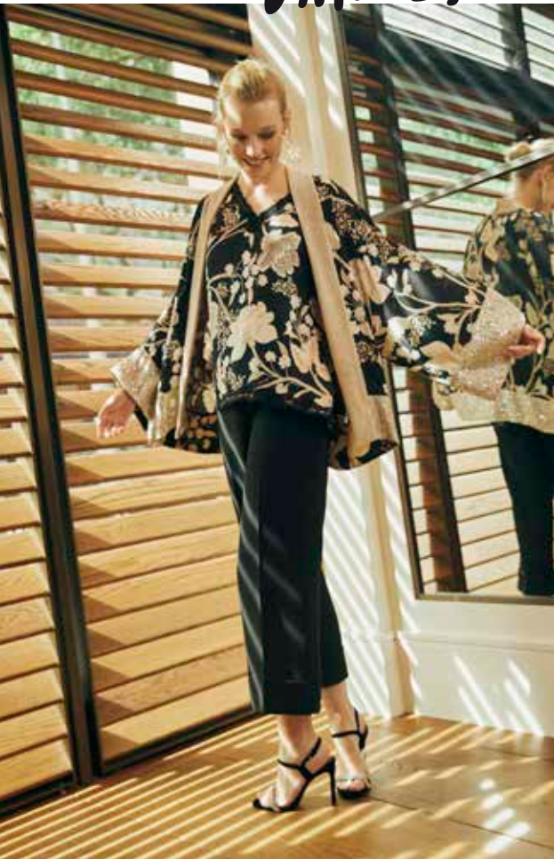
Kimono 35301 Trousers 46312