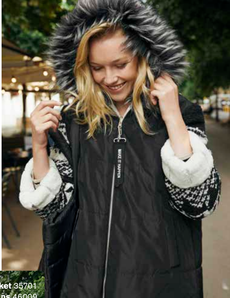
Jacket 35701 Jeans 46009